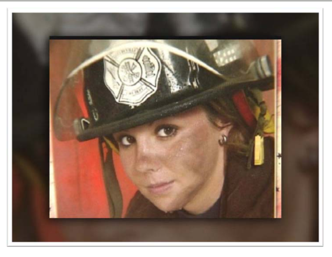
Patsalides v. City of Fort Pierce, 724 F. App'x 749, 750 (11th Cir. 2018)

37th Annual Civil Service Conference – September 2018